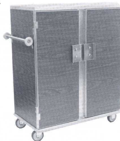
Model 9156-D-1516-14-6 with optional vinyl on all 4 sides