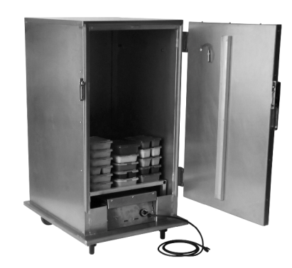
STYLE "B" 2285-HIN-ST-0608-153