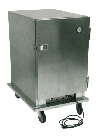
STYLE "A" 2285-HIN-910-48 (slides on 3" centers)