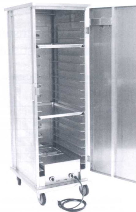
Hot Angle Slide Cabinet Model 9280-H-1817

HE-2000 Heating Unit: 2000W Heating coil, 2075W total, 17.3 amps at 120 VAC, 60 Hz single phase, furnished with *20 amps cord, 8 ft. long with 3 prong Nema 5-20P grounding plug. An off-on switch, a 75W blower, full range thermostat and power and heating pilot lights are standard. Unit has over 4 quarts capacity water reservoir with optional adjustable opening cover. Blower and heating coils are thermally protected. The unit is easily removable without the help of any tool. Optional 220-240V available.