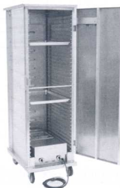
Hot Extruded Sides Cabinet Model 9250-H-1834