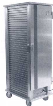
Hot Corrugated Sides Cabinets Model 9270-H-1834