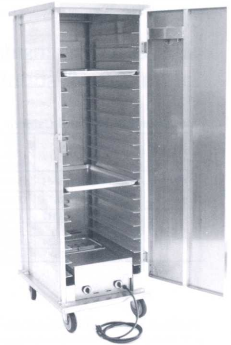
Hot Angle Slide Cabinet Model 9280-H-1817

HE-2000 Heating Unit: 2000W Heating coil, 2075W total, 17.3 amps at 120 VAC, 60 Hz single phase, furnished with *20 amps cord, 8 ft. long with 3 prong Nema 5-20P grounding plug. An off-on switch, a 75W blower, full range thermostat and power and heating pilot lights are standard. Unit has over 4 quarts capacity water reservoir with optional adjustable opening cover. Blower and heating coils are thermally protected. The unit is easily removable without the help of any tool. Optional 220-240V available.