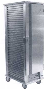
Hot Corrugated Sides Cabinets Model 9270-H-1834