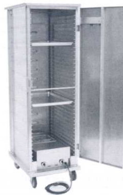
Hot Extruded Sides Cabinet Model 9250-H-1834