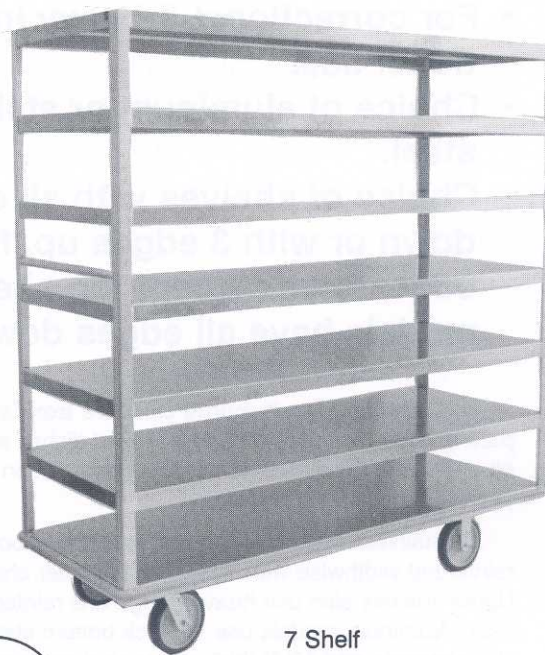
7 Shelf Model S-5065-7-72

These special Queen Marys are "off-shoot" of our existing product line to allow more shelf clearance for these special items without giving up number of shelves. Also these large shelf sizes provide excellent carrying capacity. Shelves are reinforced with fully boxed channels. In addition, shelves longer than 60" have additional center "C" channel or rectangular tubing brace. 8" polyurethane casters (2 rigid, 2 swivel), push handle & wrap around bumpers are standard.