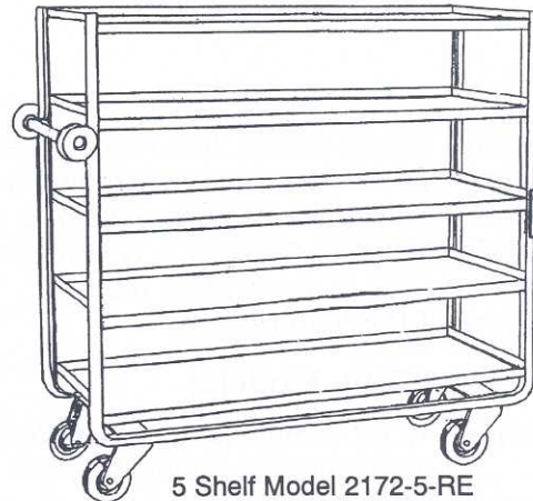
5 Shelf Model 2172-5-RE (with 3 edges up, 1 edge down)