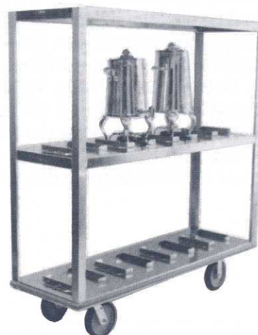
For Coffee Pots Model 9506-3CO-2166

Due to large variation in sizes and styles of chaffing dishes and coffee pots, please contact factory for pricing and send two dishes with the order for a perfect fit.