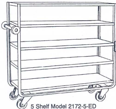
5 Shelf Model 2172-5-ED (with all edges down)