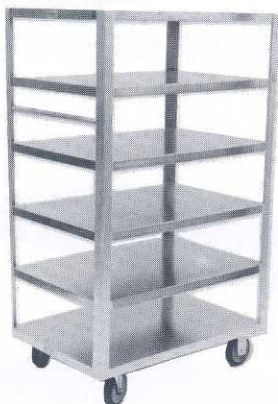
6 Shelf Aluminum Model 9026