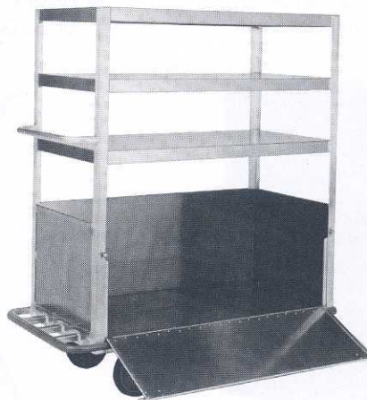
Model 9070-54 (with front open)