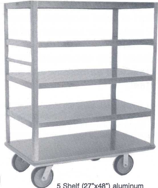
5 Shelf (27"x48") aluminum Model 9504-4-2748