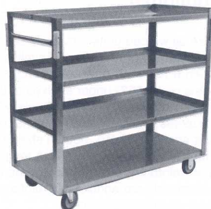
4 Shelf Stainless Steel Model 2028-RE with upper shelves with 3 edges up, 1 edge down.