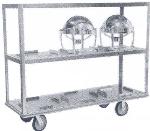
For Chaffing Dishes Model 9506-3CF-2772

These carts offer an excellent solution. Special brackets on shelves restrict the movement and prevent spilling and colliding. Carts come completely assembled with 8" poly casters and non marking perimeter bumper.