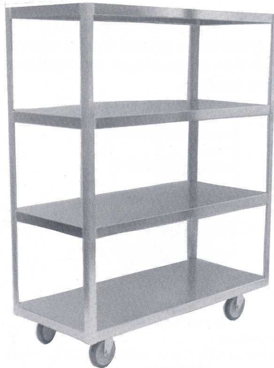
4 Shelf Aluminum Model 9045-HD-AL-4-2454

Adequate shelf clearance and easy maneuverability make these racks ideal work horses. Other size and many options are available