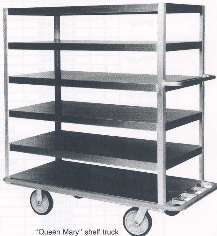
"Queen Mary" shelf truck Model E-11007