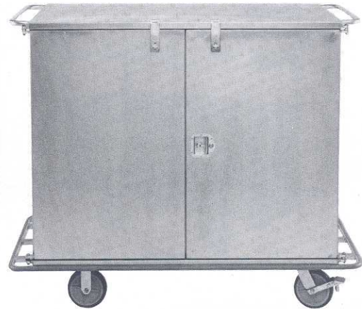
Aluminum Cart with door Model S-5036-54 (with optional top mounted latches second handle & wheel brakes)