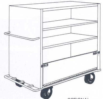
OPTIONAL Completely enclosed on three side with front flip door (see option E)