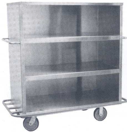
Stainless Steel Cart without door Model S-5181-54 (with optional second handle)