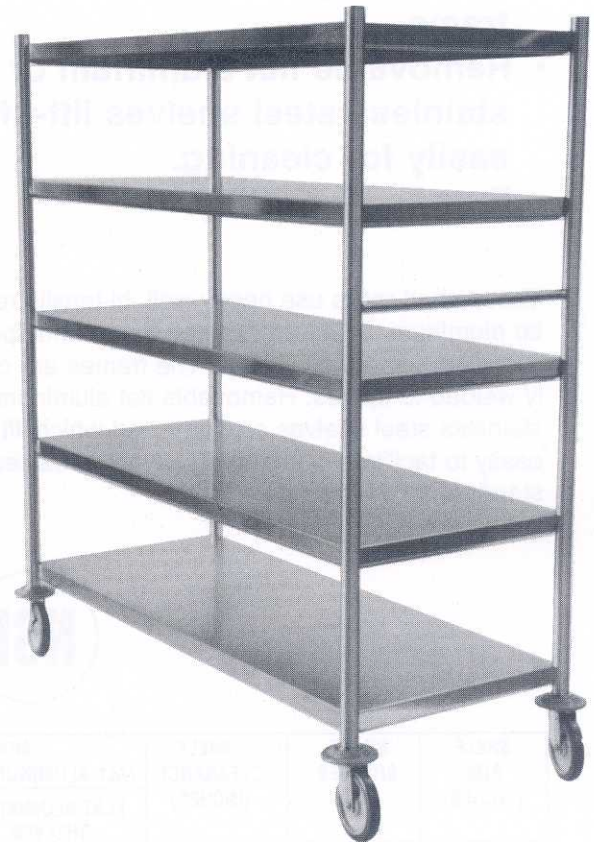
2306-5-2460-5 (5 shelf Queen Mary)