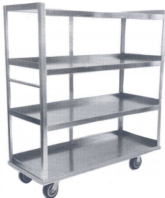
4 Shelf (27"x75") Model

These heavy gauge carts are ideal workhorses for inflight kitchen transportation. 6" plate casters are standard. Edges are turned up on sides and back to prevent items from falling down during transport.