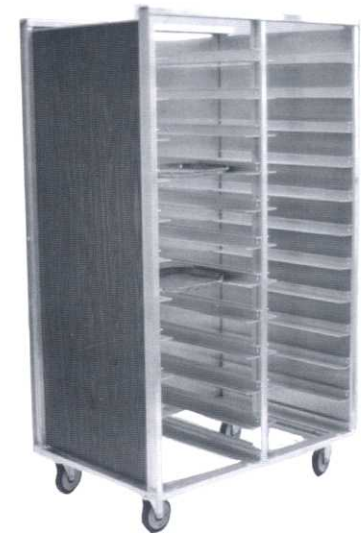
Trapezoid Slide Type Model 9170-1824 (Double side loading)