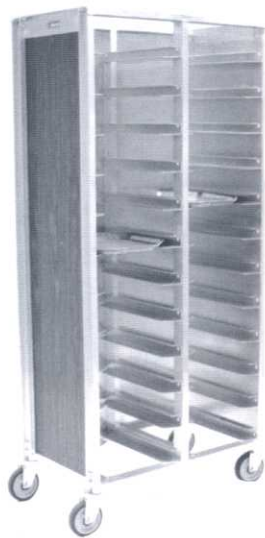
Trapezoid Slide Type Model 9170-1424 (Single end loading)

■ These deluxe racks provide superior holding, transporting and bussing capabilities of meal trays in hospitals, cafeterias and many other food service establishments. Available for various tray sizes in end loading or double side loading models with a further choice of slides. Trapezoid channel slides are ideal for trapezoid trays which prevent trays from "tipping over." Attractive "woodgrain" vinyl on 3 sides with 5" deluxe swivel casters make these ideal workhorses.