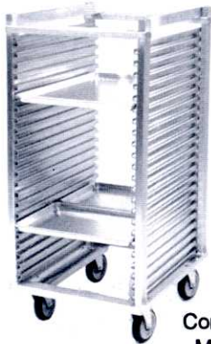
Corrugated, Tray Top Model 9586-CR-18

These aluminum half size racks provide greater work flexibility and yet require little floor space. Table top models have stainless steel top which lends itself as a durable work surface. Outrigger racks will hold two extra 18"x26" bun pans on sides and allow a cutting board to be placed in the middle. 5"x1 1/4" casters provide great mobility.