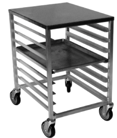
9581-BL-MD-08 (w/optional s/s top)