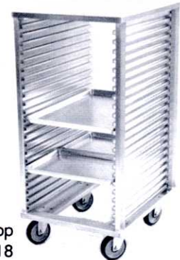
Corrugated, Table Top Model 9586-ST-CR-18

These aluminum half size racks provide greater work flexibility and yet require little floor space. Table top models have stainless steel top which lends itself as a durable work surface. Outrigger racks will hold two extra 18"x26" bun pans on sides and allow a cutting board to be placed in the middle. 5"x1 1/4" casters provide great mobility.