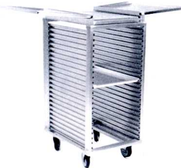
Outrigger Type, Corrugated Model 9586-CS-CR-18