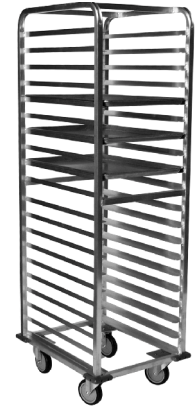
9581-SD-20 (w/optional corner bumpers)