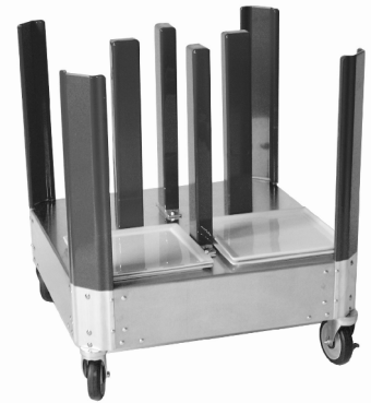
4 Section Dolly Model 9602-1212-200