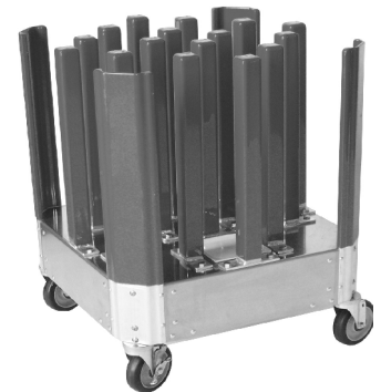
8 Section Dolly Model 9602-0505-480

NOTE: Due to many variations in square and rectangular dishes/platters, these dollies are made to order and 2 sample dishes/platters are required for each size ordered. Total capacity and size may vary depending upon the dish/platter configuration. Dollies for oval shape platters and for sizes not listed above are also available. Consult factory.