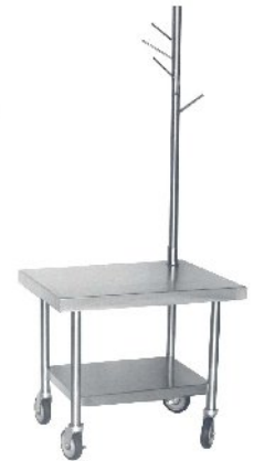
2607-2530-SL (with optional accessory post)