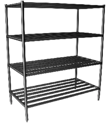
2309-EHD-3060 (Round tubing type stationary unit)