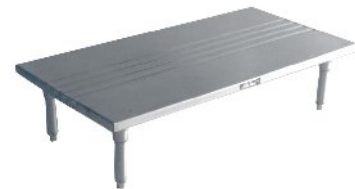
Channel Type 2313-2448-CS

Note: Solid shelves type dunnage racks are also available with lengthwise channels. Add "-CS" after solid shelf model number. Priced same as louvered shelf type.