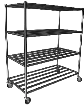
2309-EHD-3060-M (Round tubing type optional mobile unit)

*For mobile units, add “-M” after the model number O.A. height for mobile unit is 66” with 5” casters and shelf clearance is 16½” approx. See Options below.