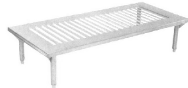
Louvered Type 2314-2454