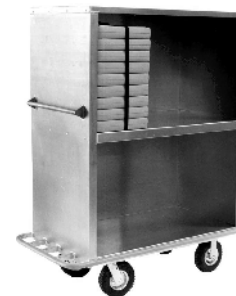
S-5036-2-2449 (with optional pneumatic casters)