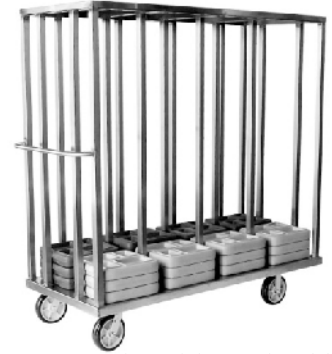
4 section stainless steel model 9130-SS-4-160-1315 (shown with optional solid top)