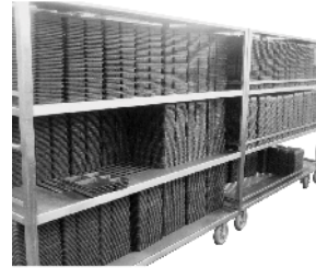
2148-EHD-4-3677 (2 carts shown side by side with stacked trays)