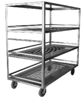
2148-EHD-4-3677 (Trays not furnished)