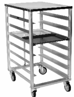
9586-1514 (shown with optional pan stop)

Note: 3/4 and full height racks are also available. See catalog page D-3 (price list PD-2) for these racks. Other slide spacings & capacities are also available. Racks for 16"x22" trays are also available with universal angle slides to accommodate 14"x18" & 15"x20" trays. Consult factory.