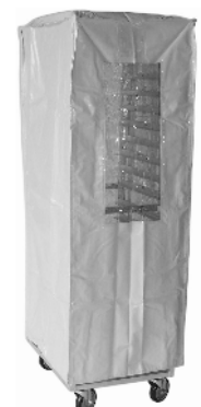
Rack cover WHD-15

*CV-12 is not recommended for freezer use.