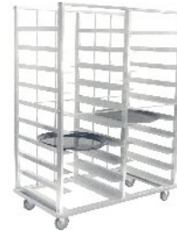
S-4358-D-20 (with optional pan stops & perimeter bumper)