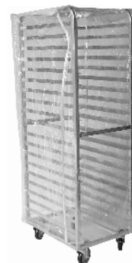
Rack cover CV-12