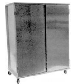
Double section 9156-D-OT-20