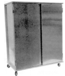
Double section 9156-D-OT-20