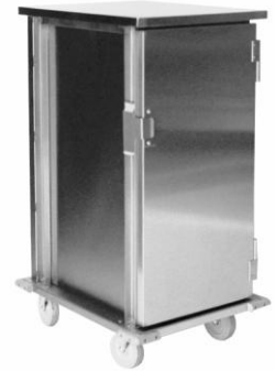
S/S Model 2200-1-F-1507