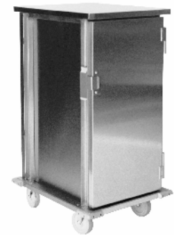
S/S Model 2200-1-F-1507