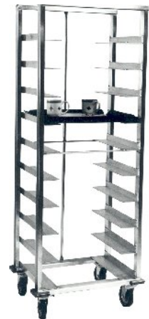
9585-LA-1822-10 (with optional corner bumper & pan stop)

NOTES: 1. These racks are also available in s/s construction. Consult factory. 2. Racks can be tailor made to suit different tray sizes, capacities & spacings. Consult factory. Sample trays are required with order. For options, see Table DD-1