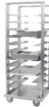
S-3131-EHD-12-F-SS (with optional integral pan stop)