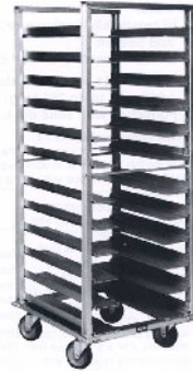
S-3131-R (with corner bumpers)