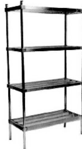
9355-RT-4-1842 (Tubing Type)