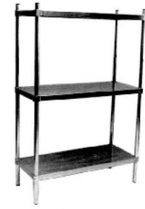
9355-SLR-3-1842 (Reinforced solid shelf type)

NOTE: Before ordering, determine no. of shelves for each unit required & multiply applicable shelf price by no. of shelves determined. Add price for set of posts from table below to come up with total price of each unit.