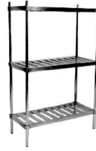
9355-TB-3-1842 (T-Bar Type)