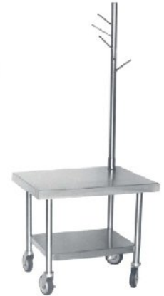
2607-2530-SL (with optional accessory post)