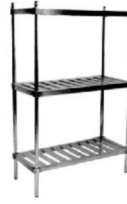
9355-TB-3-1842 (T-Bar Type)