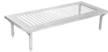
Louvered Type 2314-2454