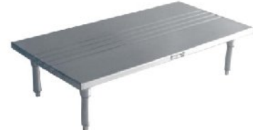
Channel Type 2313-2448-CS

Note: Solid shelves type dunnage racks are also available with lengthwise channels. Add "-CS" after solid shelf model number. Priced same as louvered shelf type.