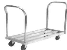
Mobile 9090-M-1836 (with optional push handle)

** For stainless steel models, add "-SS" after model number.