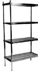
9355-RT-4-1842 (Tubing Type)