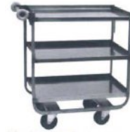
STYLE "A" MODEL 2164

Style "B": Two 5" swivel casters & two 8" fixed wheels.