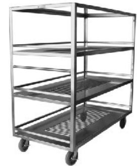
2148-EHD-4-3677 (Trays not furnished)