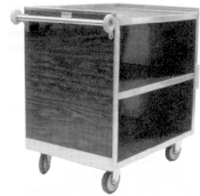
2008-HD (with optional vinyl on 3 sides)