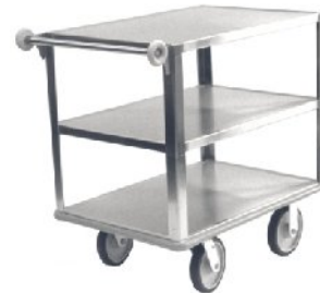
2045 (with optional wrap around bumper)