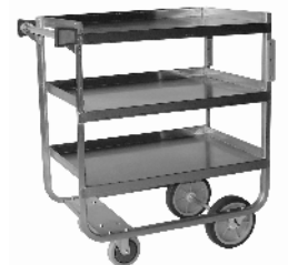
3 Shelf Model 2166-EC