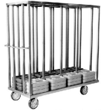
4 section stainless steel model 9130-SS-4-160-1315 (shown with optional solid top)