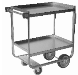
2 Shelf Model 2167-EC