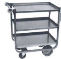
STYLE "B" MODEL 2166