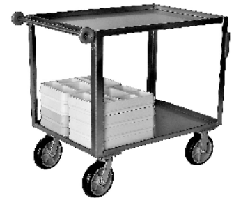
2143-U-35-2 (all 4 edges up)