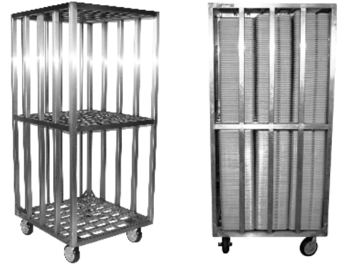
9566-SS-EHD-3234 (Trays not furnished)