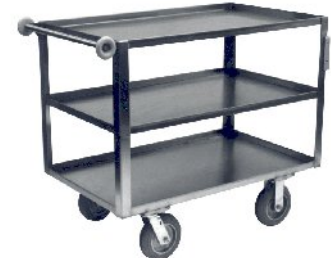
2142-U-42 (with optional 8" balloon casters)