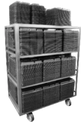
2148-HD-4-2548 (Trays not furnished)