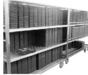
2148-EHD-4-3677 (2 carts shown side by side with stacked trays)